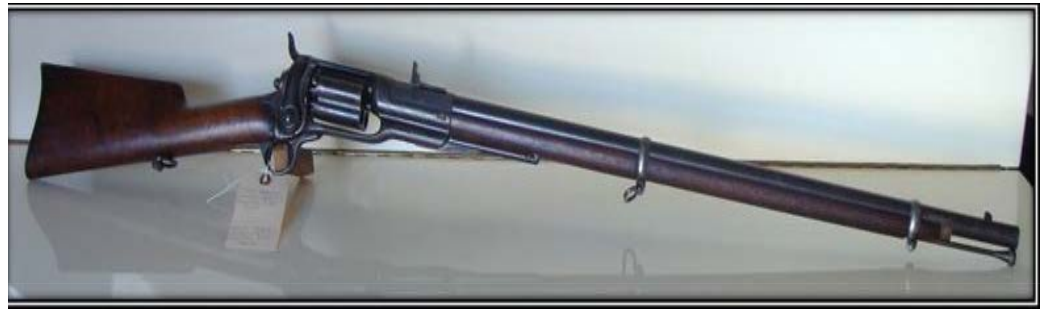
1855 “COLT” REVOLVING RIFLE 56 CAL.