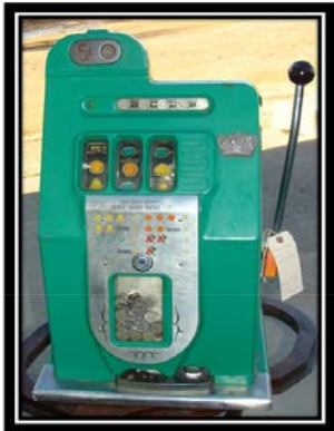
Antique “Mills” 5¢ Slot Machine