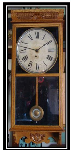
Antique Oak “Ingraham” Wall Clock