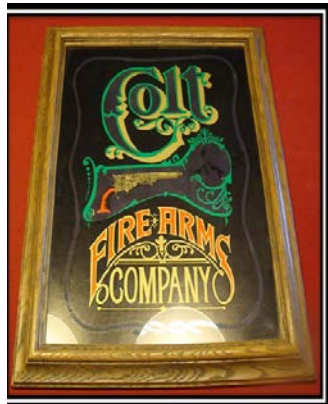
“COLT” FIREARMS ADVERTISING MIRROR