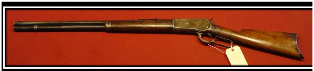
1886 “WINCHESTER” RIFLE 40-65 CAL.