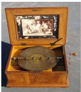
ANTIQUÉ “SYMPHONION” DOUBLE COMB METAL DISC MUSIC BOX WITH 10 ORIGINAL DISCS